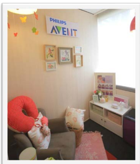
Comfortable breastfeeding room in a corporate office in the Philippines, with poster reminding users of Avent feeding bottles.

Despite WHA resolutions on conflicts of interest, more health professionals are now being drawn into industry-sponsored associations, which act systemically as conduits between companies and the public, or even between companies and governments. In Nigeria, as in many countries, paediatric associations readily accept Nestlé support for exhibitions, seminars and meetings on infant and young child topics. In Colombia, Nestlé 'guides' the healthcare system and professionals by sponsoring the co-production of the " Guide to Clinical Practice in Neonatology " published by the Ministry of Health and Social Protection in collaboration with the Colombian Association of Neonatology.