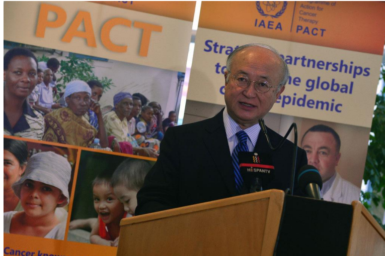
Here is the director-general of the International Atomic Energy Agency, Yukiya Amano , delivering his address during the 2013 World Cancer Day

radiotherapy machines in low-income countries. Too many people in these regions die of conditions that are treatable. He said that his agency, set up to promote the peaceful uses of atomic energy, is undertaking over 130 projects in cancer diagnosis, management and treatment in Africa and has supported low-income countries to the tune of $US 250 million in the past three decades.