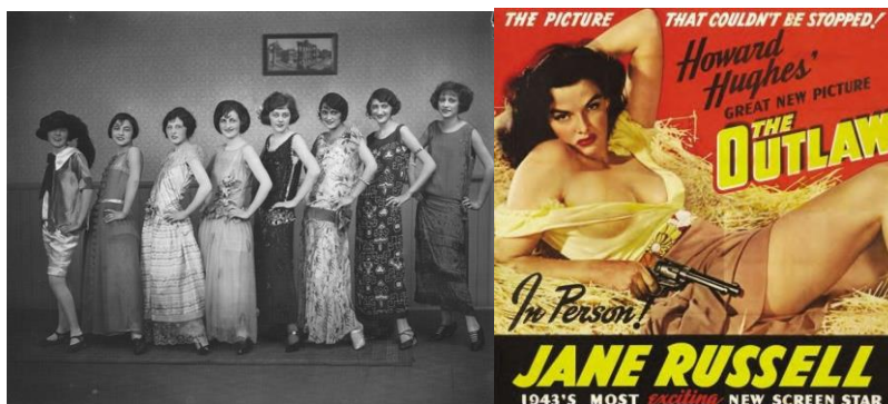
The decades of change. Left, a array of flappers photographed in the 1920s. Right, 1940s: Jane Russell after superstructure design by Howard Hughes

tall but small-breasted. In Brazil where I live, the shape of female beauty is that of the violin: wide hips (well-adapted to bear children), and small breasts.